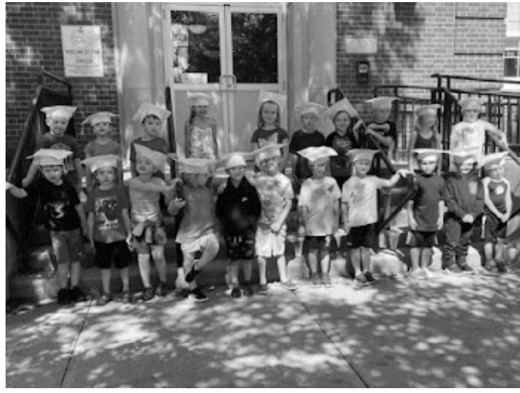
PreK students participated in a graduation ceremony on Wednesday, June 22nd. Kindergarten, here they come!